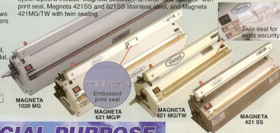
MAGNETA 1020 MG