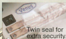
Twin seal for extra security.