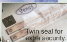
Twin seal for extra security.